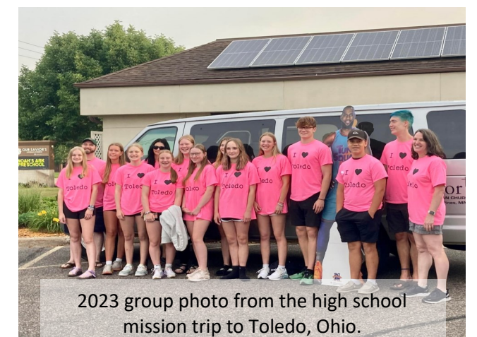
2023 group photo from the high school mission trip to Toledo, Ohio.