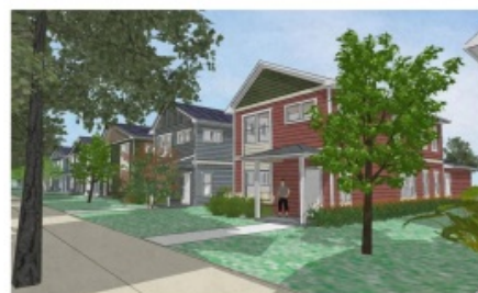
(Sample illustrations of outside and floor plans)